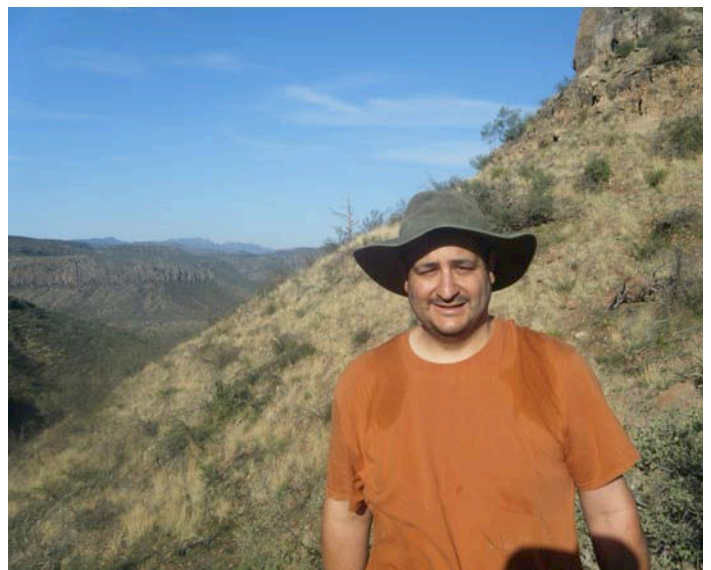
Unknown hobo found wondering in the mountains by the Boy Scouts Troop 589