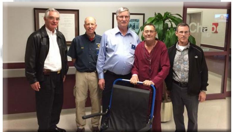
Visit with the Veterans at the VA Hospital